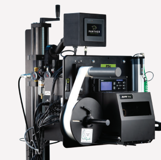
Small Footprint for compact spaces.

Mitigation of waste and loss due to human error or outdated manual processes.