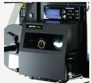
OEM print engine capability with SATO or Zebra printers, depending on need or preference.