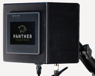
Remote-mounted 7" touch screen display allows for flexible placement options on the system or elsewhere.