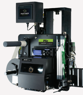
Zero waste pneumatics - only uses air during operation.